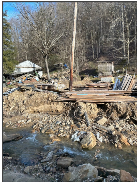
Some of the flash flood damage in Eastern Kentucky near Hazard.

Link to Kit Information: https://thenalc.org/wp-content/uploads/2023/01/NALC-DR-Kits_January2023.pdf